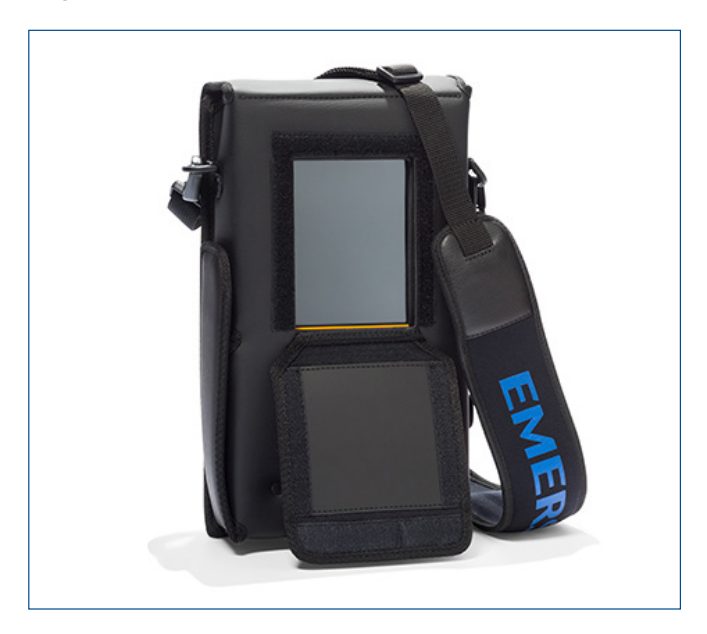
The useful carrying case protects your Trex unit in the field and provides storage options for accessory items.

Using the ValveLink Mobile app on the Trex unit, you can perform valve diagnostics in the field, including valve signature, dynamic error band, PD one button sweep, and step response, without having to pull the valve or perform invasive troubleshooting steps. ValveLink Mobile works with HART and FOUNDATION Fieldbus Fisher® FIELDVUE™ digital valve controllers and provides an intuitive user interface that is easy to understand and use. The large touchscreen on the Trex communicator makes it easier than ever to see all valve diagnostic details.