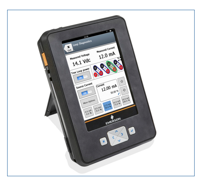
The rugged form factor is built for an industrial environment.